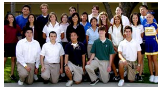
The graduating class of 2007 will include the first students to earn the IB Diploma. The International Baccalaureate program requires students to take a rigorous course load, complete a 5,000 word essay, and do many hours of service.