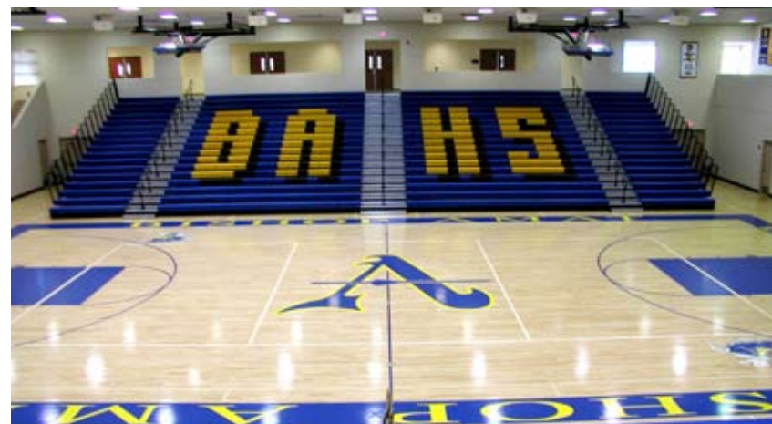
The Student Activity Center allows the entire Amat community to gather as one for mass, spirit rallies and other special events. The building also houses weight rooms, locker rooms, a dance studio, athletic offices, and the faculty dining room.